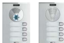
ref.70748 4 Push. ref.70744 4 Push.

SERIES 4 // Panel: 130x199 Flush box (ref.8854): 115x185x45