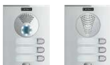
ref.70728 3 Push. ref.70724 3 Push.

SERIES 3 // Panel: 130x175 Flush box (ref.8853): 115x162x45